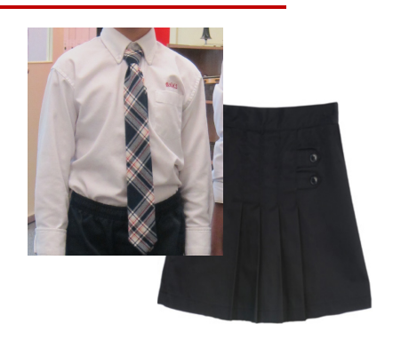
Formal Uniform - Junior High Option 1