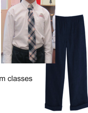
Formal Uniform - Junior High Option 2