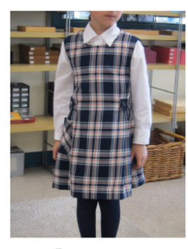
Formal Uniform Junior Elementary Option 1